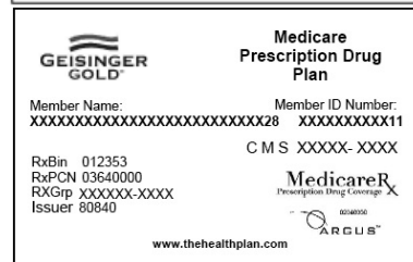
Sample ID cards subject to change pending CMS approval